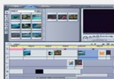
Pinnacle Studio Plus

With Pinnacle Studio MediaSuite, you can play with a broader range of media and take your video editing to a new level. Pinnacle Studio MediaSuite comes with Studio Plus as well as a complete collection of comprehensive tools developed by specialists for working with other media files before, during, and after video editing, including: